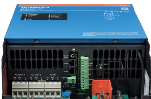
Connection Area MultiPlus-II 3k